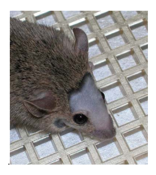
Figure 2. A mouse that has been barbered by a cage mate.